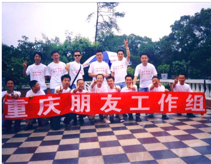
The core committee of the Chongqing Rainbow Group