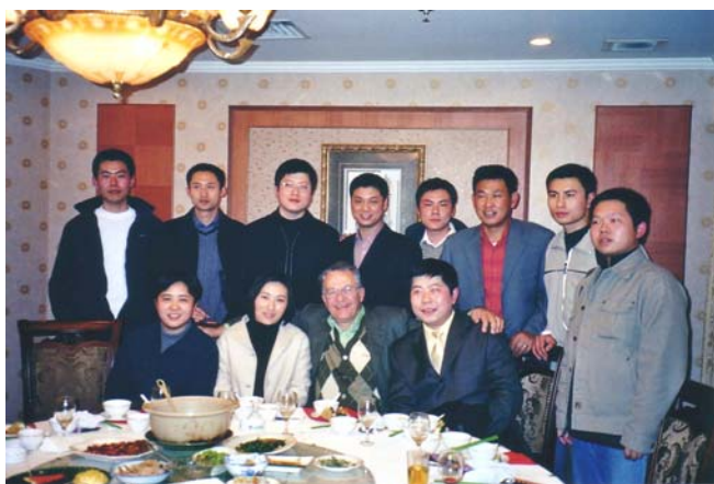
Nanjing Gay Hotline