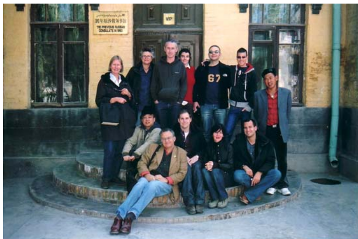
The steps of the old Russian consulate.

While in Xinjiang our Trustees and lecturers visited Kashgar where the rival British and Russian consulates faced and outfaced each other 100 years ago.