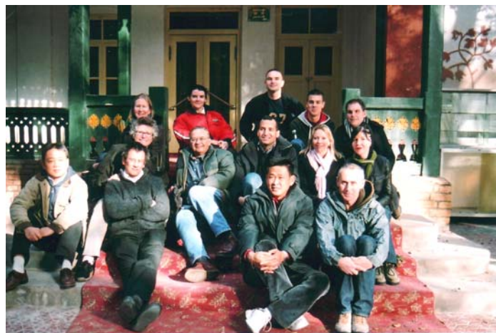
The steps of the old British consulate (Chini Bagh).