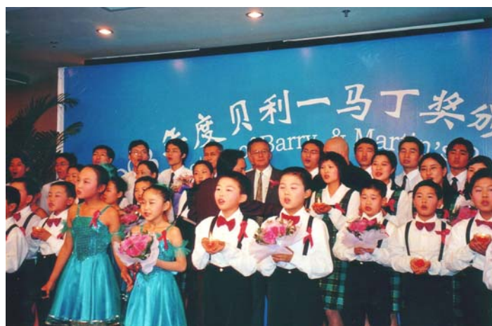
Following the prize-giving the school children came to sing for us.