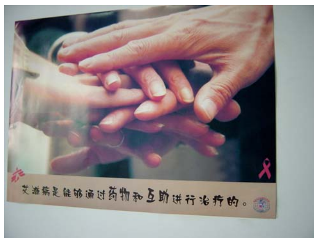
Aids awareness poster in Wuhan.