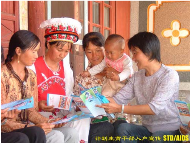
A member of the Family Planning Association in Dali gives Aids instruction wearing her local Bai costume.