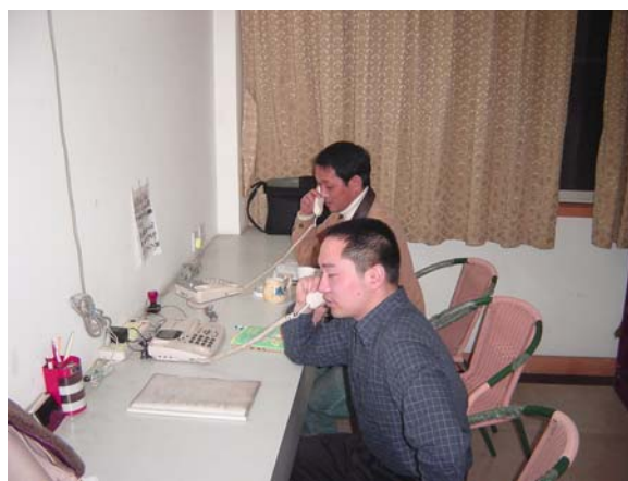
Wuhan Gay Hotline answering calls