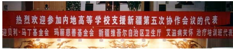
Banner proclaiming our workshop in Urumqi, Xinjiang October 2003.