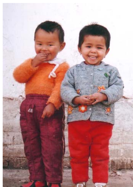
Young friends we met at Kashgar.