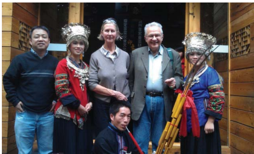
Typical Guizhou welcome.